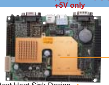
Best Heat Sink Design