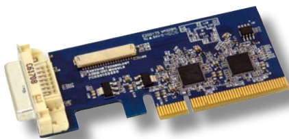
ADD2-DVI-DUAL Part #820952