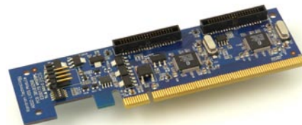
ADD2-LVDS-DUAL Part #820950