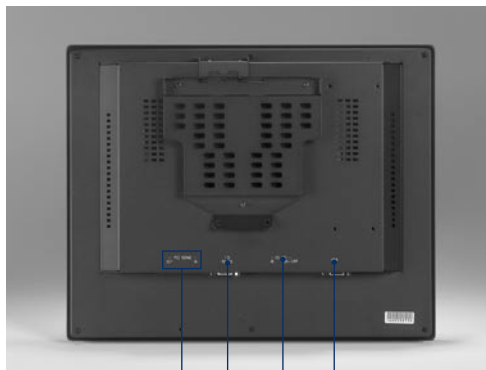
KB/MS PS2 connector RS-232 port (Touch screen) Power ON/OFF VGA Port