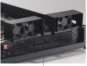
Three filtered 10-CFM cooling fans are on front-end