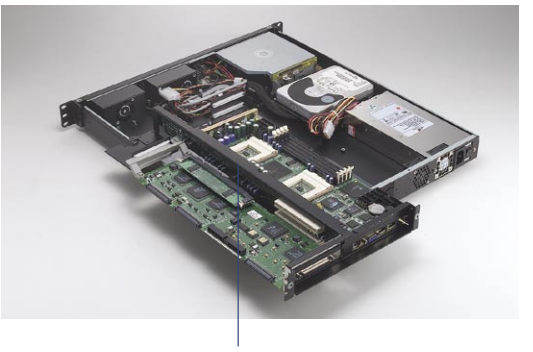
Butterfly backplane design supports two full-length 64-bit PCI expansions