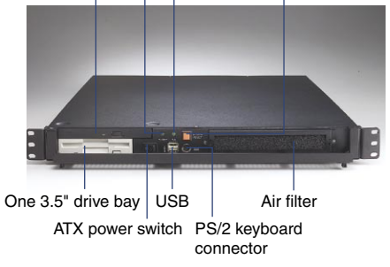
Power LED One slim CD-ROM HDD LED System reset switch