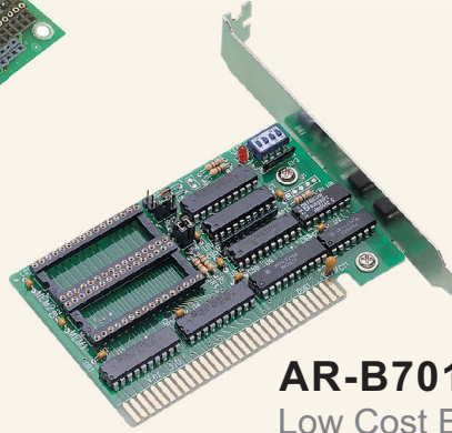
AR-B7010 Low Cost EPROM Disk Card