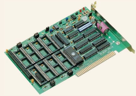
AR-B7041 8MB Flash EPROM/RAM/ROM Disk Card