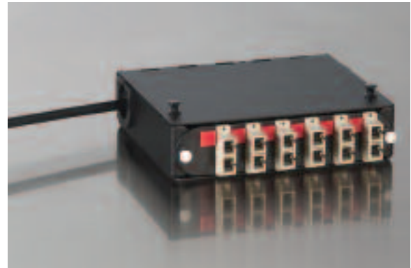
Single Panel Housing with SC Duplex Connectors | Photo LAN670