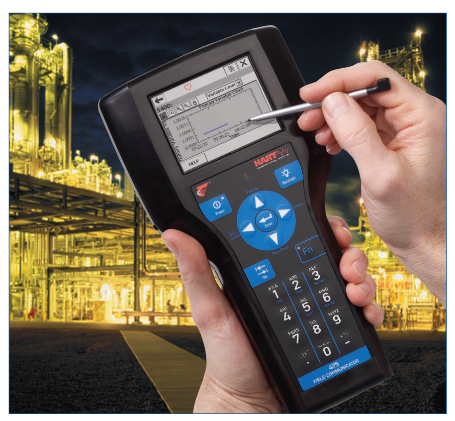
Designed not only for use on the bench, the 475 Field Communicator also enables you to do those tasks that just have to be done in the field.