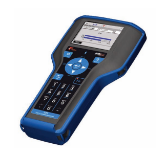
The protective rubber boot provides added protection in the field.

The 475 Field Communicator is designed, manufactured, and tested to very demanding specifications. It is ready to go wherever you need to go to get the job done.