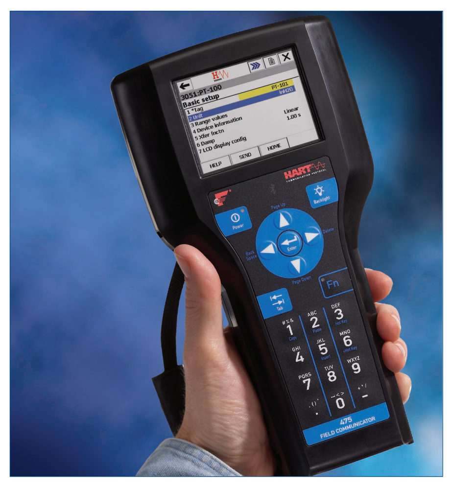
The 475 Field Communicator is designed to support all HART and FOUNDATION fieldbus devices from all vendors.