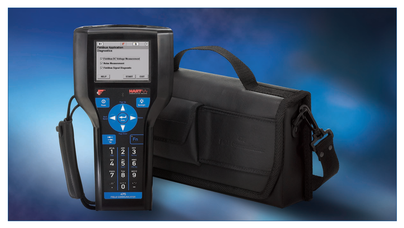
The 475 Field Communicator, with its handy carrying case, provides a single tool for configuring and diagnosing HART and FOUNDATION fieldbus devices.