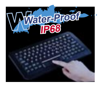
86 Key Water-Proof Keyboard with Pointing Device