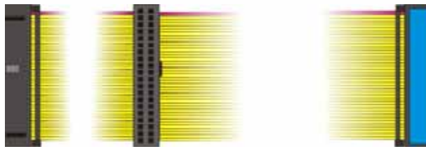
40-pin ATA100 IDE flat cable x 1