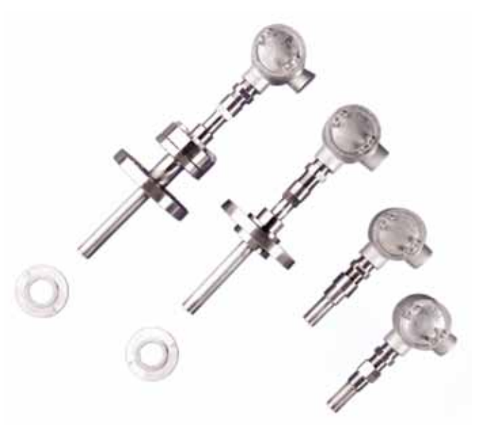
Bundle Waveguide Technology System

Even though most ultrasonic manufacturers' flowmeters can only handle up to 500°F (260°C), GE's BWT systems have been able to reach up to 1000°F (537°C). The unique design removes the piezoelectric element from the extreme temperatures by using wave guide technology. The transducer can even be swapped out under operating conditions. One customer has installed 16 units, replacing their wedge meters, and has had them operating maintenance free for more than five years.