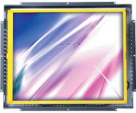
Open Frame Type

17" High Speed Panel PC with Touch Screen, MainBoard, 12V DC Adapter