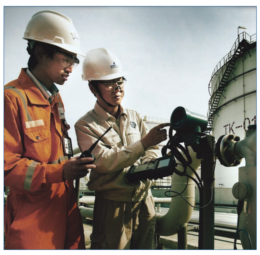
Designed not only for use on the bench, the 375 Field Communicator also enables you to do those tasks that just have to be done in the field.