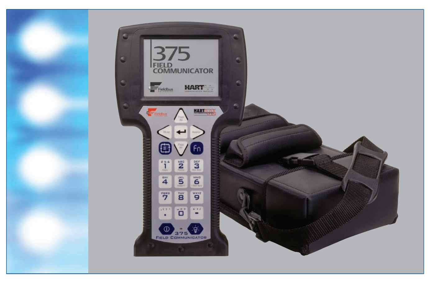
The 375 Field Communicator, with its handy carrying case, provides a single tool for configuring and diagnosing HART and FOUNDATION fieldbus devices.