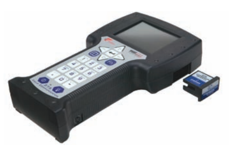
The Configuration Expansion Module safely stores hundreds of device configurations.

Together, the 375 Field Communicator and AMS Device Manager enable you to efficiently manage all of your devices, the assets that are the foundation of your process.