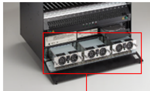
560W ATX power supply with active PFC (2 + 1 redundant)