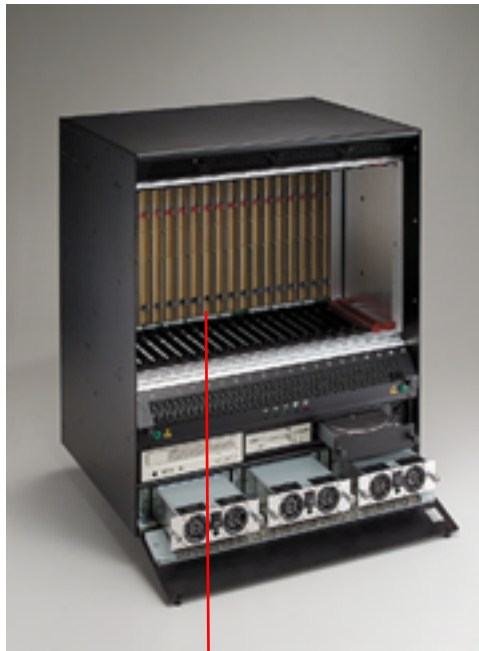
20-slot backplane with H. 110 CT bus