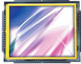
Open Frame Type