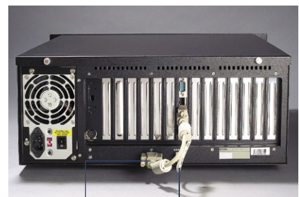
VGA convert cable Keyboard convert cable