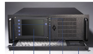
OSD power LCD display HDD LED Power LED Slim type keyboard and touch pad