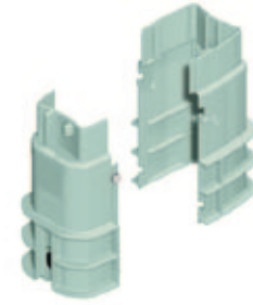
Short Split/Rehab Base