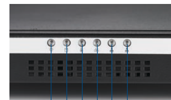
PWR | Temp. | LAN1 HDD | FAN | LAN2