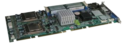
PICMG 1.3 Processor Board based on the Intel® Xeon Dual-Core or Quad-Core LGA-771 package