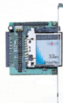
A-1054 / A-1054A