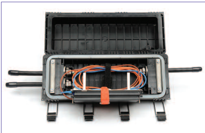
UCA3-6 FITL (with flip tray open) | Photo TRCLS100