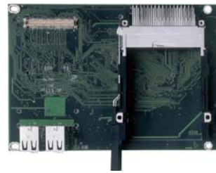
HS-420 -- PCMCIA and USB2.0