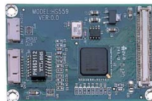
HS-559 -- LAN