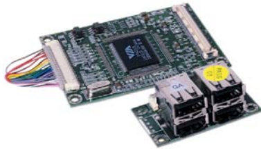
HS-200 -- Mini PCI to USB2.0