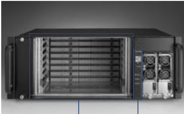
MIC-3038A/B: 8-slot backplane with H.110 CT bus MIC-3038C (cPSB): 8-slot packet switched backplane