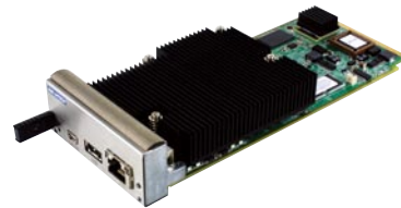
Figure 1: MIC-5602A2-M2E with Full-Size Front Panel