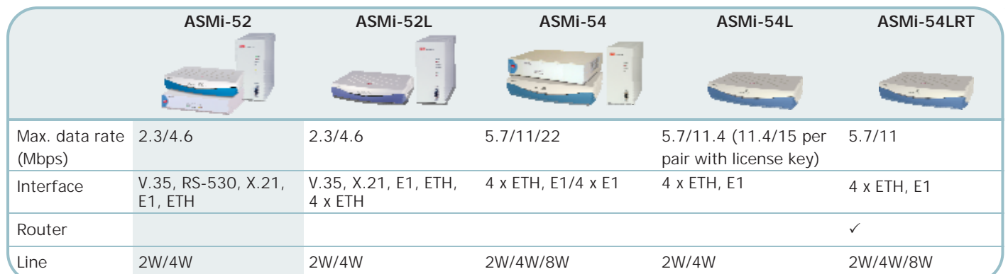
Modem Comparison Chart