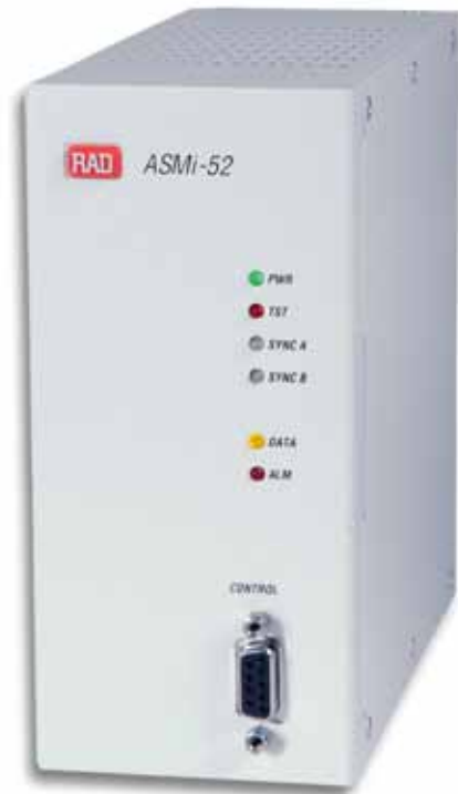
Rail-mount Metal Enclosure

Dedicated managed SHDSL modem for Ethernet, E1 and serial services over 2- or 4-wire copper lines