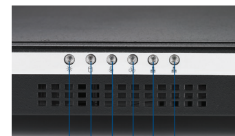
PWR | Temp. | LAN1 HDD | FAN | LAN2