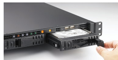
Dual front-accessible SATA HDD trays