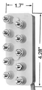
RPT5A4 Fig. 5