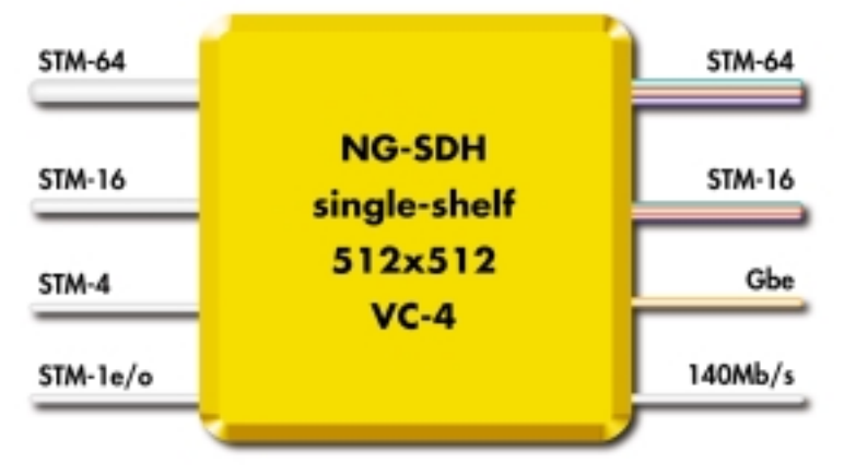
Fig. 1: Alcatel 1670 SM - Multi-Service Transport Platform

Ethernet that may host SX and LX plugin modules in different combinations. Alcatel 1670 SM single shelf solution provides STM-64 interfaces for double 10Gbps-ring interconnection or in MSP 1+1 configuration, while colored STM-64 and STM-16 interfaces can be used for direct interworking with DWDM systems at reduced costs. Its high capacity features allow the termination of multiple subtended STM-1/4/16/64 rings within the same node. Alcatel 1670 SM features a full symmetrical architecture that means there is no distinction between aggregates and tributaries. For this reason the system fully supports Cross-Connect applications, in addition to Terminal Multiplexer and Add-Drop implementations in different topologies such as spurs, rings or mesh. Equipment's shelf is physically divided in two parts. In the lower area physical boards are located (controls, matrices and up to sixteen I/Os). The upper area hosts additional I/O access boards for maximum traffic density. Alcatel 1670 SM supports in fact "any traffic port in any slot" design approach, allowing the broadest flexibility mix according to any traffic need.