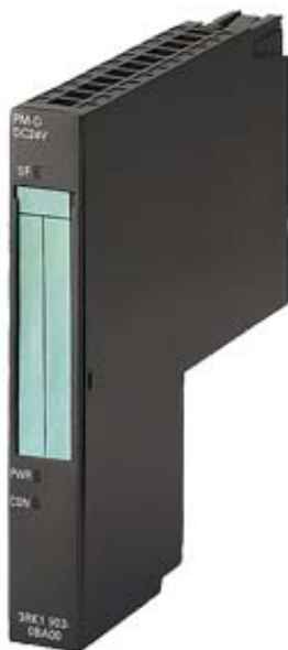
PM-D FOR ET 200S POWER MODULE FOR STARTER