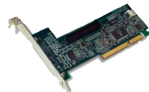
ADD-LVDS Part #820935