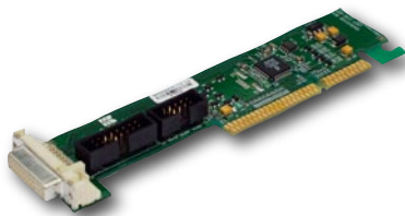
ADD-DVI-I/CRT (Low profile) Part #820942