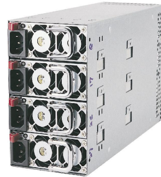
Dimensions: 101.2(W) x 167.2(H) x 300(D) mm

N+1 Redundant Configuration Meet 4U Rackmount System