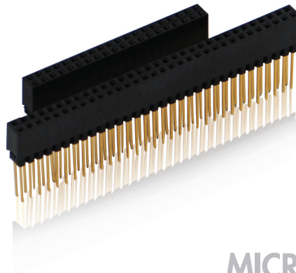
Spacer Kit - PC/104