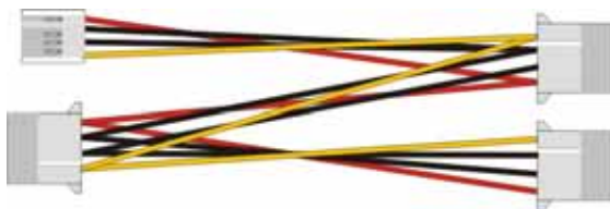
4-pin to 4-pin Power Cable x 1