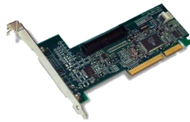
ADD-LVDS Part #820935